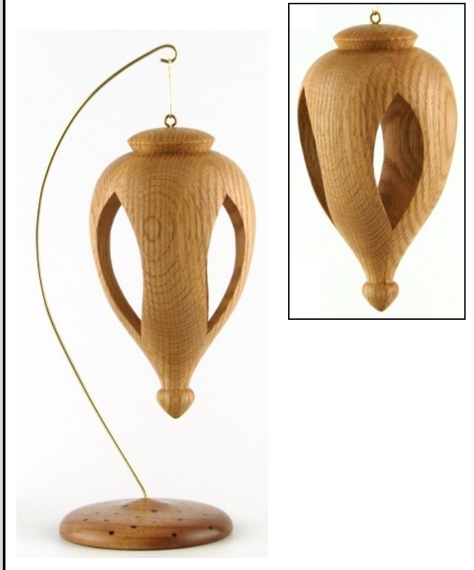
Steve Newberry Inside Out Ornament approx. 3" dia. x 5" long