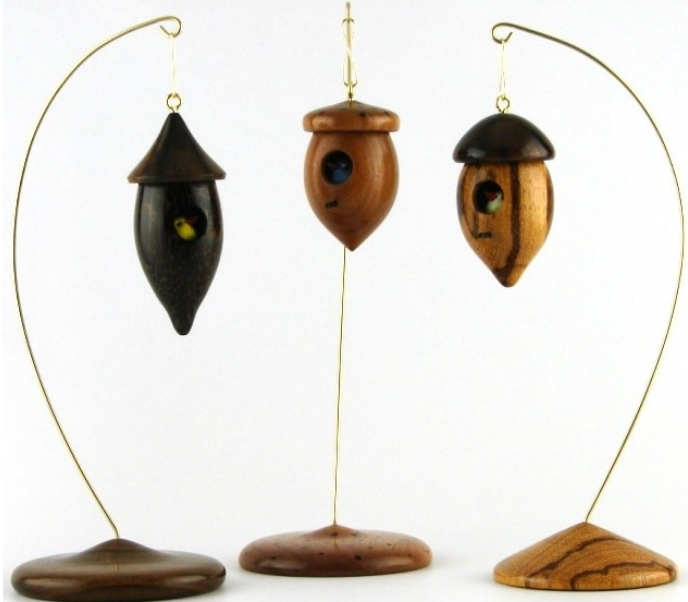
Black Palm &amp; Walnut