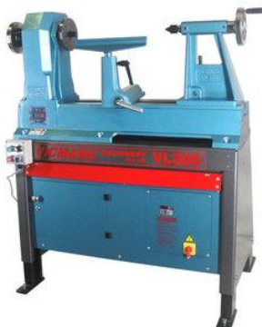
Photo of new Vicmarc VL300