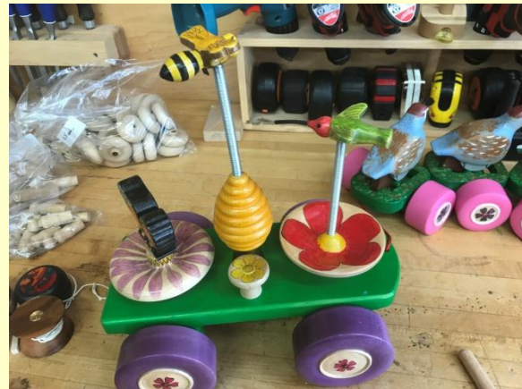
A multiple animated toy with springs and cams.