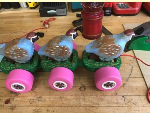
A pull toy with cam-actuated quail.