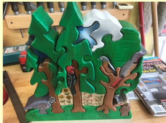
A puzzle toy made on a bandsaw.